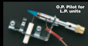
O.P. Pilot for L.P. units