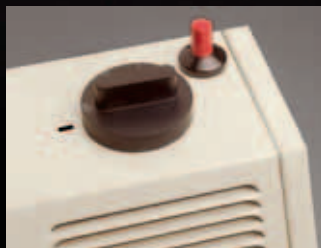
VFM Top Control

■ Piezo Ignitor – requires no matches to light unit.