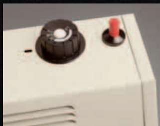
VFT/BFT Top Control

■ Top Operated Controls – facilitates “no stoop” operation.