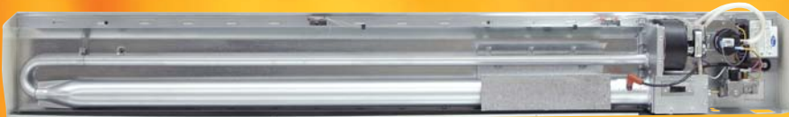
9,000 BTU (Face Off) 72" (183 CM)