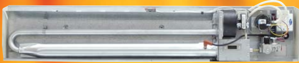
5,000 BTU (Face Off) 48" (122 cm)