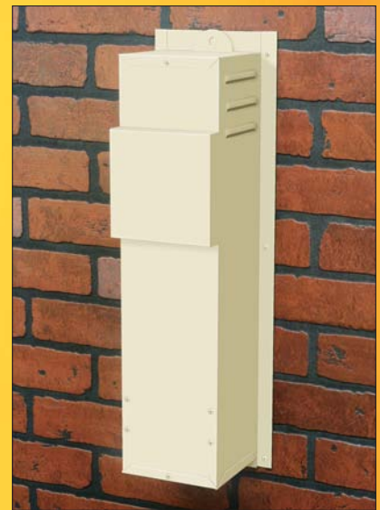
Vent Riser Kit - VRK5/10