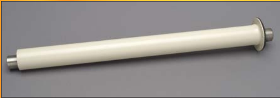
4"-16" Vent System (Standard)