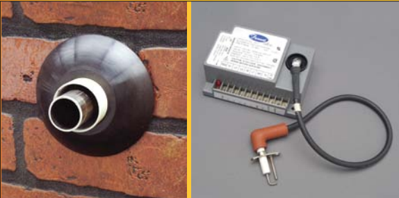
Standard Vent with 1-1/2" I.D. Seal