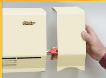
Side Valve Concealer