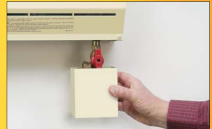
Bottom Valve Concealer